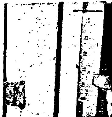
LAPD Photographer C. Collier took this close up photo of fellow LAPD officer C. Wright measuring with a ruler the 9th bullet, located behind the stage.